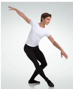
Fitted , T-Shirt plain black or white