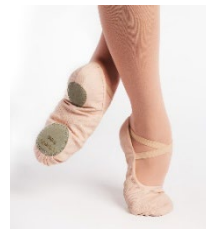
Pink/skin-toned ballet slippers