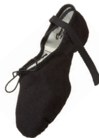
Black ballet shoes