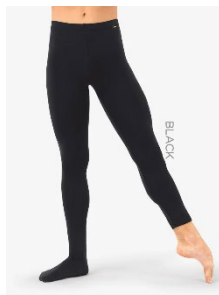
Black ballet tights or fitted athletic pants