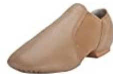
Tan or black jazz shoes

Please wear black or skin toned undergarments (dance belt).