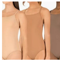
Skin toned leotard