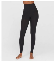
Black leggings ( plain )