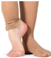
Skin-toned convertible tights